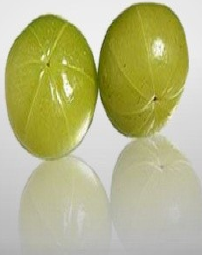
AMALAKI ( Emblica Officinalis )